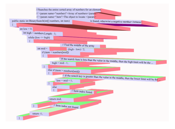
Fig. 3. Visual 3D representation of the coding history

3D representation of the coding process is provided (Fig. 3). Provides the ability to scale and rotate the 3D image.