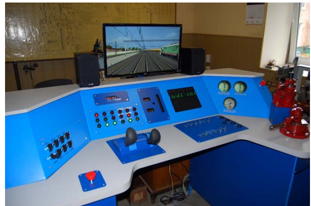
Fig. 2. Train driver's workbench.

More complex simulator (Fig. 2-4) including software and hardware devices was created by the team of K. Zheliezov, O. Zabolotnyi, L. Ursulyak, Y. Chabanuk, A. Shvets, A. Akulov at Engineering and Design Specialised Department «Microprocessor-Based Control Systems and Safety in the Railway Transport» (EDSD MBCSS) of Dnipro National University of Railway Transport. Main purpose was to create the simulator allowing to train locomotive drivers in the conditions close to real [5, 13]. The simulator consists of two workbenches – for driver with locomotive control panel and for instructor. As it is known, various series of locomotives have different control panels, their controls are functionally similar, but structurally different from each other, thus, for simulators designed for various types and series of locomotives, reuse of the hardware is almost impossible. As for the software part, which includes a train model, a traffic segment model, a train situation management model, a locomotive system operation model, etc., here a lot of models can be reused with minor changes or without them at all.