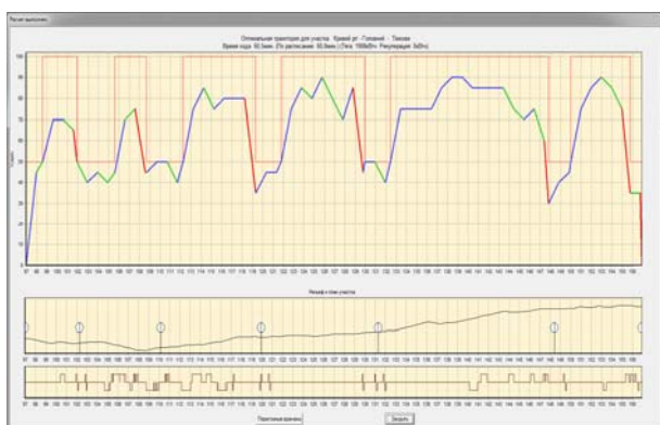
Fig.4. Example view on instructor's work bench with calculation of energy effectiveness of driver operations (upper part), profile and states of light signals (down part) where the blue, green and red lines mean traction, free running and regenerative braking driving modes respectively [5].