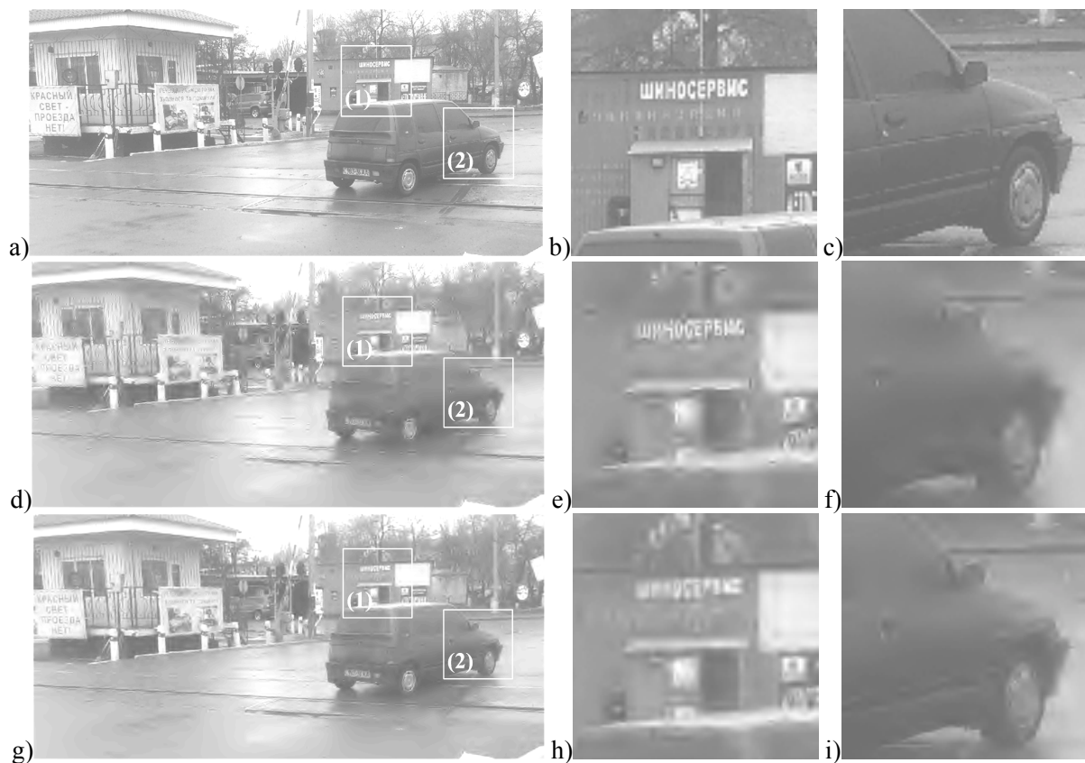
Fig. 3. Compared images: (a)–(c) – original, (d)–(f) – plain SPIHT compressed, (g)–(i) – proposed pre-processing with SPIHT

Test set contains 16 greyscale images of LC (see examples at Fig. 1 and Fig. 3 (a)). Original image (Fig. 3 (a)) has been pre-processed by proposed method and then has been processed with SPIHT method. Resulted image (Fig. 3 (g)) was compared to image processed by plain SPIHT (Fig. 3 (d)). SPIHT was chosen since it is one of the popular wavelet compression techniques [12].