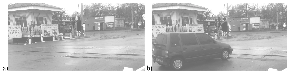
Fig. 1. Examples of level crossing image: without obstacle (a), with vehicle (b)

Рис. 1. Примеры изображения железнодорожного переезда: без посторонних объектов (a), при наличии автомобиля (b)